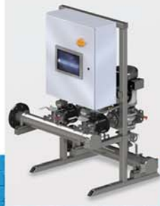
Delta Pak - VM